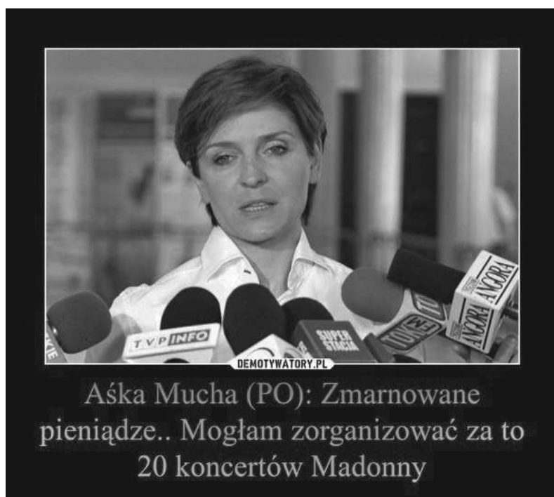
Meme 8: Waste of money. I could have organized twenty Madonna concerts for that amount. 33

Madonna's concert took place on 1 August 2012 and was the first non-sporting event organized at the National Stadium after Euro 2012. The concert cost five million zloty. It provoked many controversies, mainly because of the date (it was held on the anniversary of the outbreak of the Warsaw Uprising) and the financial losses involved. Attendance at the concert was far lower than the organizers had expected. Nor were any sponsors found. Ultimately, the financial losses were covered by the Ministry of Sport. 34