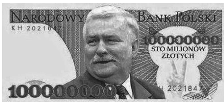
Meme 7: Lech Wałęsa and his hundred million old zloty. 31

The memes referred inter alia to Lech Wałęsa and his hundred million old zloty (meme 7).