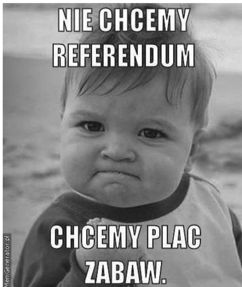
Meme 15: We don't want a referendum. We want a playground. 41

In the media discourse, reflective memes also appeared. One of them is a meme showing a child saying between his teeth: We don't want a referendum. We want a playground (meme 15).