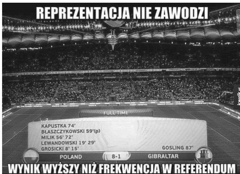
Meme 14: The scores of the Polish football team. 40