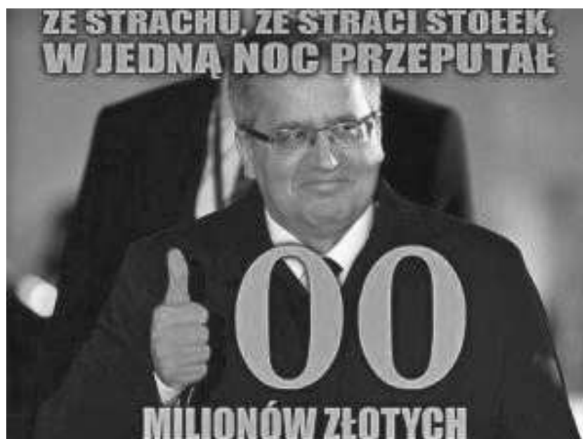
Meme 1: For fear that he would lose his position he blew a 100 million zloty overnight. 17

In other words, no matter at what cost, what mattered was to achieve the set objective and win the election. The nationwide referendum was thus treated instrumentally as a way of maintaining power.