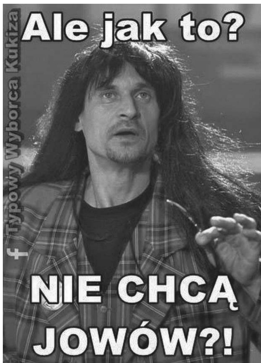
Meme 12: What do you mean? They don't want single-seat constituencies? 38