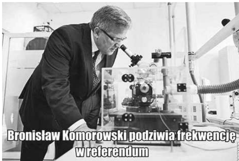
Meme 11: Bronisław Komorowski is admiring the turnout in the referendum. 37

The level of turnout in the 2015 referendum became the subject of both in-depth studies and jokes and derision in the media discourse, including the presented memes. One of the memes showed B. Komorowski leaning over the microscope. Below is the caption: Bronisław Komorowski is admiring the turnout in the referendum (meme 11).