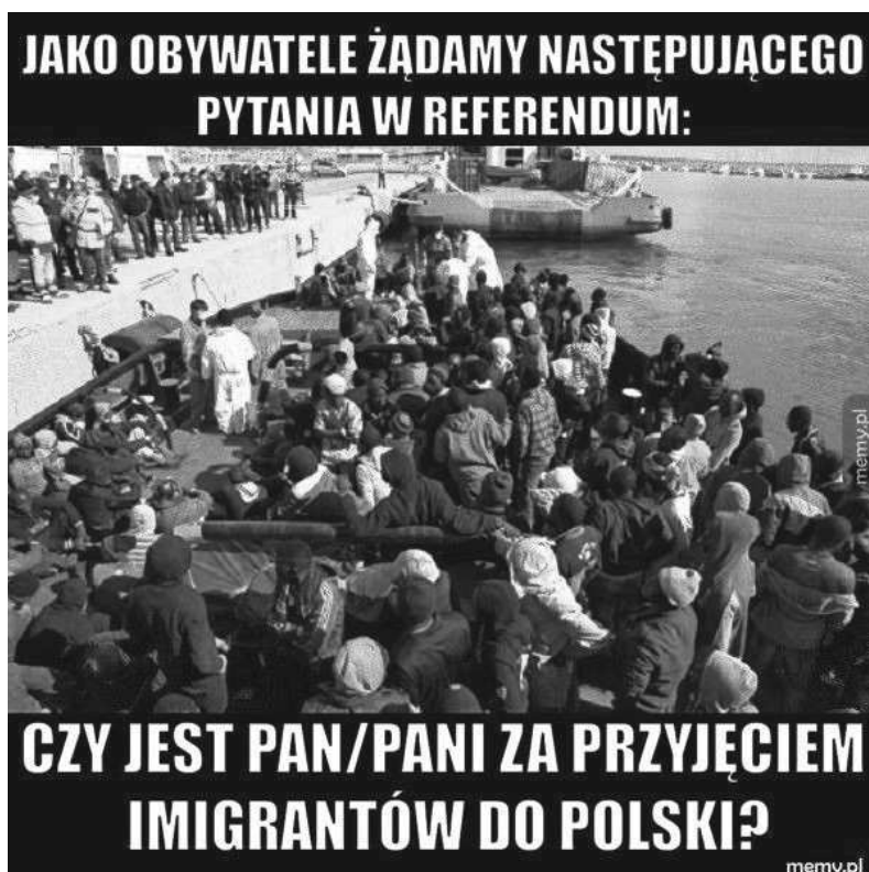
Meme 3: Are you for taking in immigrants to Poland? 25