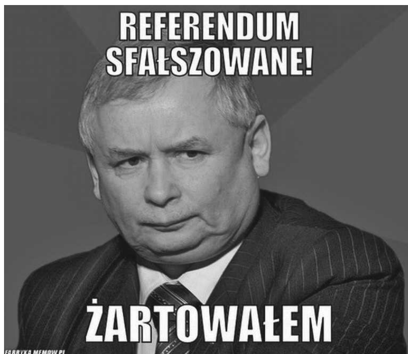
Meme 13: The referendum was rigged! Just kidding. 39