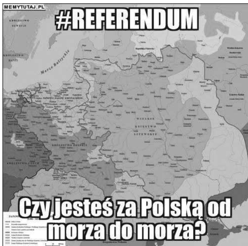
Meme 2: Do you support the idea of Poland from sea to sea? 22

The proposals to expand the list of referendum questions were reflected in many memes. One of these questions was: Do you support the idea of Poland from sea to sea? (Meme 2). In other words, are you are in favor of Poland's new borders defined by the Black Sea and the Baltic Sea?