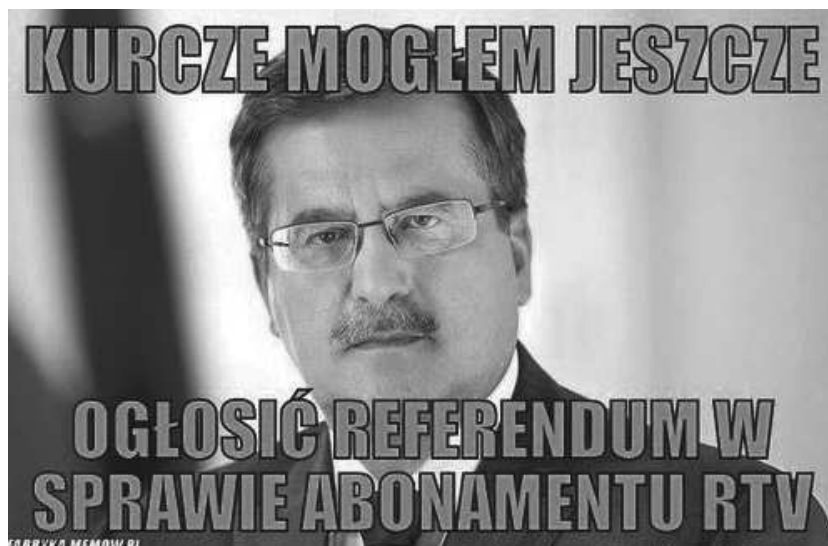
Meme 4: Damn, I could have also called a referendum on TV license. 26

One more example of a referendum question included in the memes is Bronisław Komorowski's reflection, who says: Damn, I could have also called a referendum on TV license (meme 4).