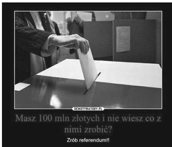
Meme 9: You've got 100 million and don't know what to do with it? Hold a referendum. 35